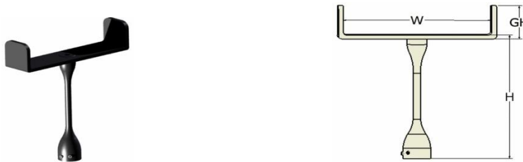
BioForm Goal Post Joystick Handle

BioForm Goal Post joystick handles ( 'Y' shape), provides a superb option for greater control of a power wheelchair for the individual who lacks dexterity with their hands. They are shaped from a piece of 1/16" x 1" aluminum with a coupling piece on the underside for easy attaching to the joystick. This coupling device has a set screw for securing it to the joystick.